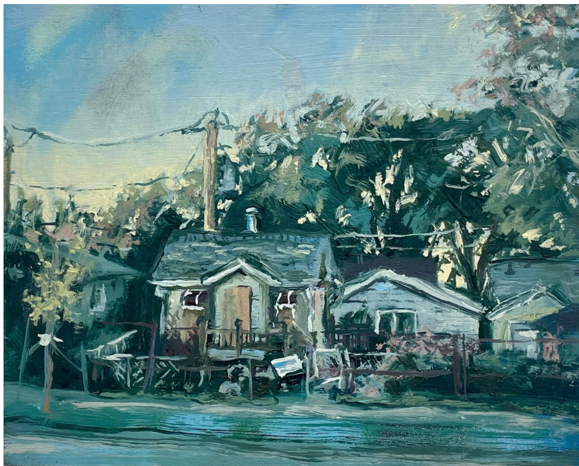
9650 on 63rd Ave, 10x8 in, oil on hardboard, 2024.

I am intrigued by how these spaces change over time, how nature weathers them and grows around them, and how people enact change on them. Particularly, the concept of 'ghosts' or what lingers or has been left behind after these spaces have been vacated and subsequently demolished. I explore what remnants, context clues, or fragments are left behind which let us infer a narrative of those whose lives shaped in and around the space.