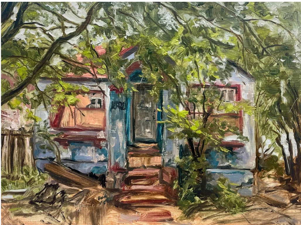
10903 on 79th Ave, 12x9 in, oil on hardboard, 2024