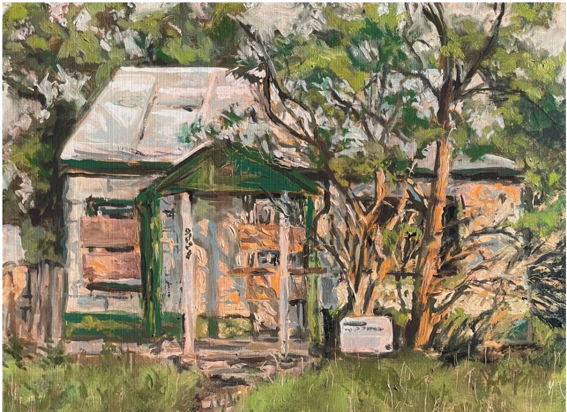
9829 on 77th Ave, 16x12 in, oil on hardboard, 2023.