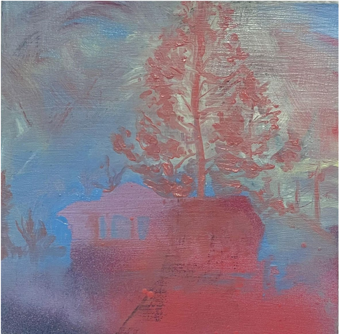
10577 on 61st Ave, 6x6 in, oil on hardboard, 2025.