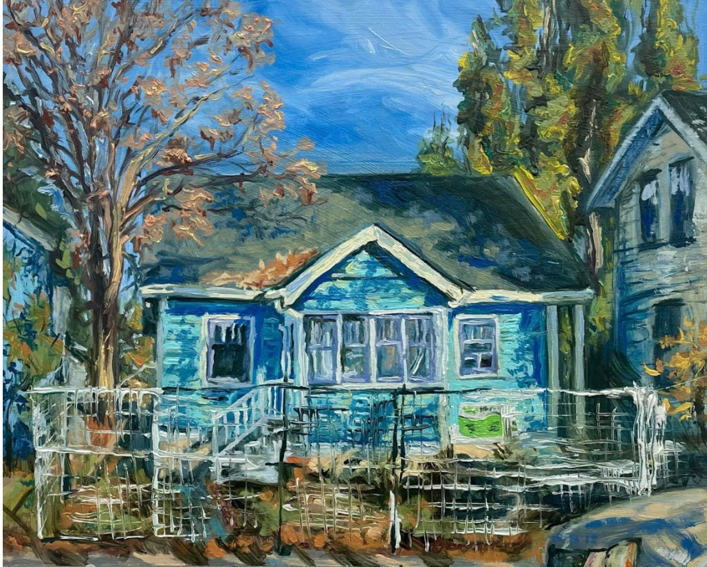
9943 on 80 Ave, 14x12 in, oil on hardboard, 2024.