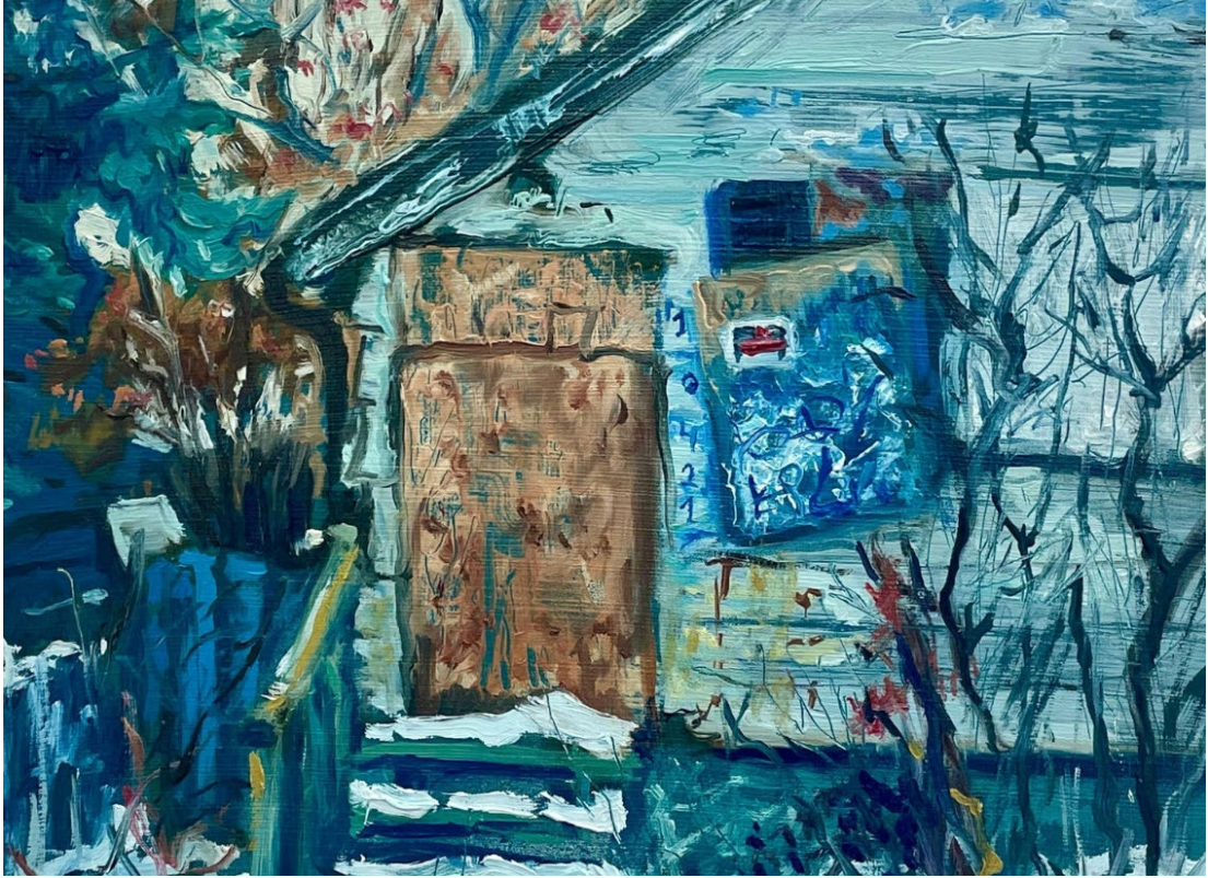
10421 on 70th Ave, 10x8 in, oil on hardboard, 2024.