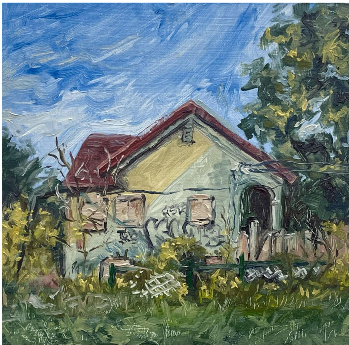
9009 on 99th Street, 8x8 in, oil on hardboard, 2024.